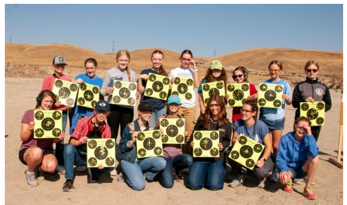
Young girls with completed targets. Most of these girls had never handled or fired a rifle.