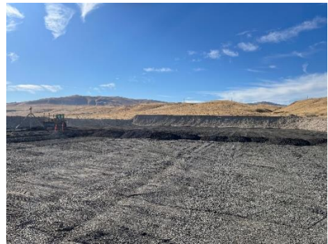
Range in progress

The new Smallbore Range under development is very near completion and Conrad Russell the contractor will be putting the final touches on shortly. The Range is a 105-meter smallbore range that will be used for .22 caliber Smallbore Matches. The Range will be able to accommodate up to 20 shooters for a Match. The range when completed will not be covered, however, the plan is to apply for a grant from the Recreation Conservation Office to build a cover in 2026. Initially shooters will shoot prone or they may provide their own benches. A conex has been purchased for storage of target stands, targets and other match materials.